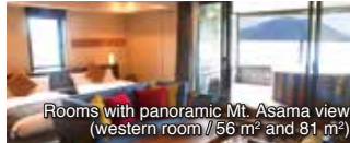
Rooms with panoramic Mt. Asama view (western room / 56 m 2 and 81 m 2 )

*8 th Floor: Family suite with an open-air bath with sky view & sky view room and 7 th & 8 th floor: Panoramic Mt. Asama View with open-air bath (2 types of rooms) view bath, please note that it is NOT a hot spring bath and you are required to fill the jacuzzi by yourself