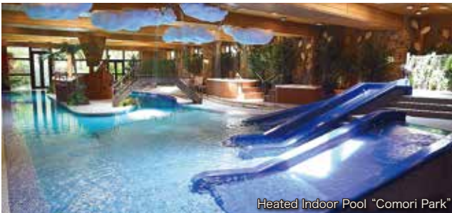
Heated Indoor Pool "Comori Park"

Enjoy the healing of nature and ease your body and mind.