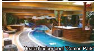
Heated indoor pool "Comori Park"