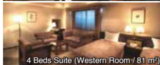
4 Beds Suite (Western Room / 81 m 2 )