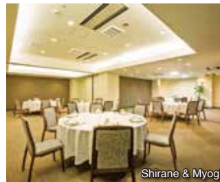
Shirane & Myogi

We produce style to fulfill customer needs in calm environment.