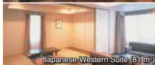
Japanese-Western Suite (81 m 2 )