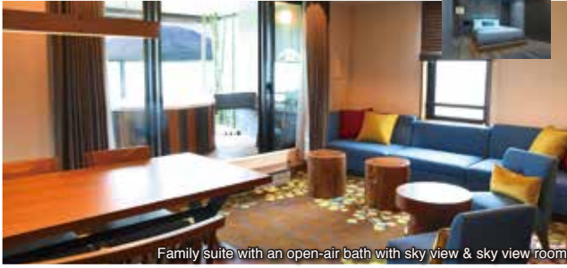
Family suite with an open-air bath with sky view & sky view room

A space with good feeling to satisfy and make calmness the whole body. A guest room with view open-air bath is opened