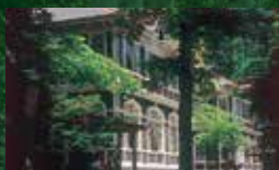
Former Mikasa Hotel